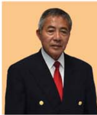
TAMAYOSE, Hidemi (* 1949)